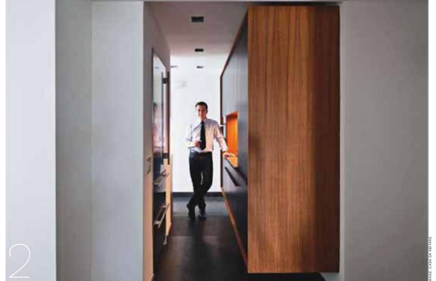
1. Living room view. 2. View towards kitchen. 1. 客廳視圖。 2. 朝向廚房的視圖。